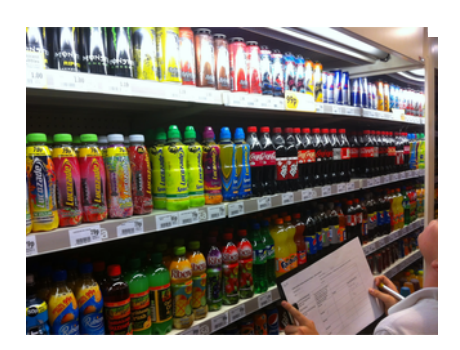
Fig 1. Photograph taken during participatory mapping exercise. https://doi.org/10.1371/journal.pone.0188668.g001

The study also involved a mapping exercise conducted by a sub-sample of participants (2–4 from each school). Three of the four schools permitted their students to take part in this exercise, which involved spending up to one hour walking around the local area (accompanied by at least one researcher and a member of school staff) to identify outlets where EDs could be purchased. The purpose was to involve C&YP in the process of generating data, enabling them to gain basic research skills and allowing the research team to gain greater insight into the availability and accessibility of EDs. A template was designed to record the location, brands, prices and sizes of the drinks available, as well as the price and availability of other beverages (isotonic/sports drinks, soft drinks and water), based on earlier food environment work [36]. Photographs were taken, inside or outside shops, where appropriate. See Fig.1 for an example.